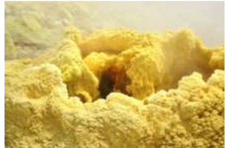
Sulphur in a volcano

Native Indians of Mexico, Ancient Greeks and Romans, Egyptians, Russians and Spaniards, Germans and Christians: they have all believed that a butterfly is the manifestation of the human soul. Psyche is the Ancient Greek for the butterfly. Our life on Earth is like that of a butterfly: the fertilised egg is planted in our mother's womb; the caterpillar stage is our life on Earth, the chrysalis is the tomb, and the butterfly is the symbolic rebirth after death.