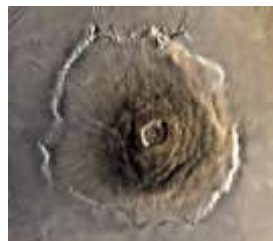
Olympus Mons

Olympus Mons is 100 times larger by volume than Earth's largest volcano of Mauna Loa in Hawaii, and is known as a 'shield volcano', which drains lava down a slope. Arabia Terra so far has the only evidence of explosive volcanoes on Mars, but it is hoped that Arabia Terra will teach scientists something new about geological processes that help shape planets and moons.