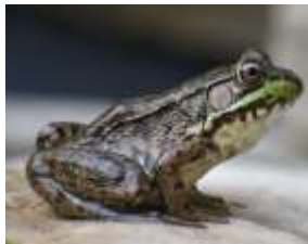
Adult frog – not like us (photo: Ken Whytock,