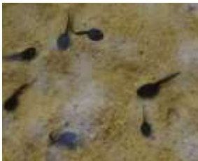
Baby frogs (tadpoles) – not like us

Frogs are amphibians; horses are like us.