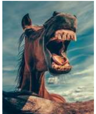
Horse – just like us